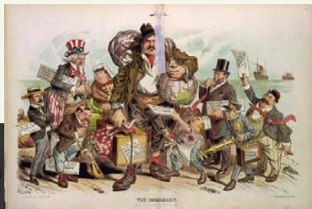
The immigrant. Is he an acquisition