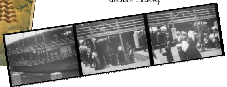
Emigrants (i.e. immigrants) landing at Ellis Island.