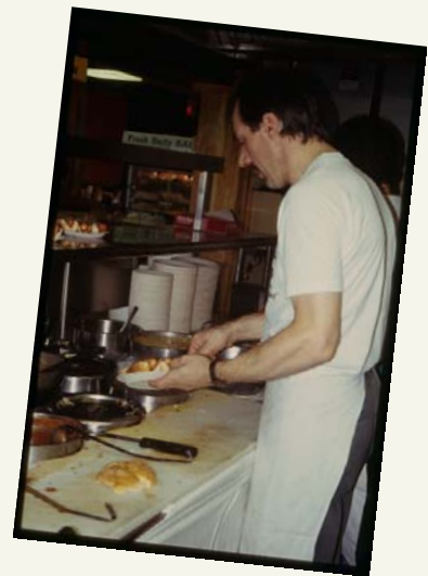
Another Hot Grill employee, a recent immigrant from eastern Europe, dresses a Hot Texas Weiner