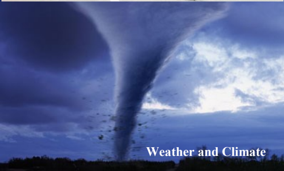
Weather and Climate