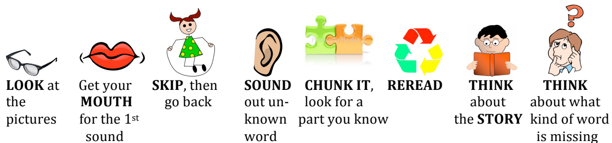
Figure 1. Word-solving Strategies

Checklists. I began the study by determining the word-solving strategies the students were currently using. The students were asked to read a leveled reading book entitled Wake Up, Father Bear , while I kept a checklist of the word-solving strategies I noticed the children using during the reading. The following word-solving strategies appeared on the checklist: Look at the pictures; Get your mouth ready for the 1st sound; Skip, then go back; Sound out word; Chunk it, look for a part you know; Reread; Think about what kind of word is missing; Think about the story (Figure 1). Four weeks later, the students were asked to read another leveled reading book entitled What We Like , while I kept a checklist of the word-solving strategies the children were using at that point after having read with their parents at home.