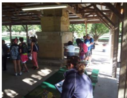
REC 4600 students begin their exploration of Morton Park with checklists in hand

Lastly, I have enjoyed being a part of the Student Association for Recreation as a faculty adviser. The executive board for the Rec. Club has been active in both event planning and fundraising; sponsoring several different events and doubling the budget through some new and creative fundraising. The Bowling Challenge, McAfee Cookout, and Progressive Dinner were some of the events sponsored by Rec. Club. A Monical’s Pizza fundraiser was implemented whereby a percentage of each check for patrons (with the Rec. Club ‘coupon’) was given back to the Club. Along with that, the Club designed and sold cups. Both of these are new sources of revenue for the club and were integral in growing the budget.