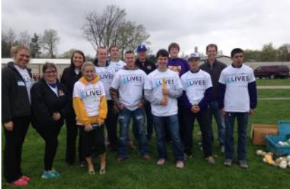
Students volunteering at the 2014 Spring Special Olympics Track & Field Meet!