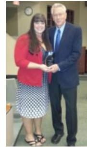
This year, the Distinguished Alum Award was presented

We would enjoy hearing from you. We have established a Facebook page for the department that can be found here: http://www.facebook.com/#!/eiuadmin Why not take a few moments to share a picture or a few words about you?