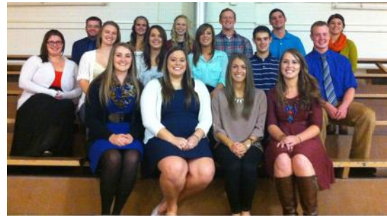
2014 Rho Phi Lambda Members

Students who have a major GPA above 3.20, completed at least 45 semester hours, and demonstrate a record of scholarship, leadership and service are invited to join the national honorary society. As of the Fall 2014, fifteen students are active members of Rho Phi Lambda. Throughout the semester, the students have volunteered and assisted with a variety of campus and community events, including the 2014 2.5K Homecoming Race, Fall Family Festival, and many more!