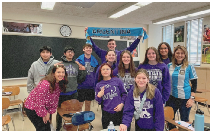
For fútbol (an Argentinian passion)...