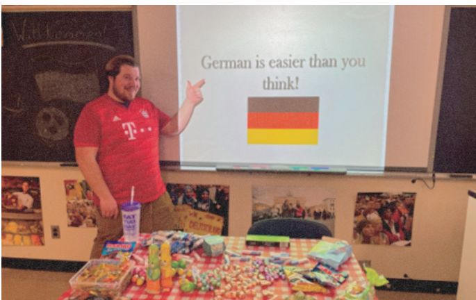
And to find out why German is fun AND easy...

High School world language teachers brought their classes to EIU!