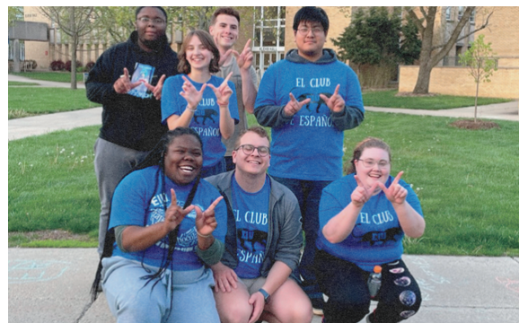
Clockwise from top left: A spring activity for German students, and one for Spanish students, fundraising outside Coleman, Spanish Club end-of-year kickball team, French and German kickball team.