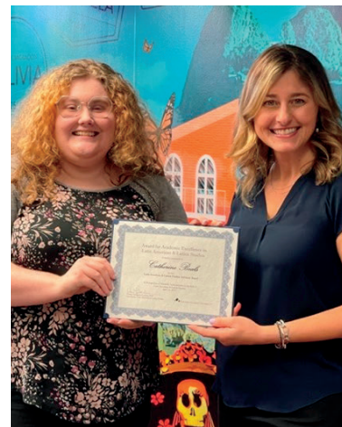
Top: Awardees of departmental scholarships. Bottom: Latin American & Latinx Studies Awardees.