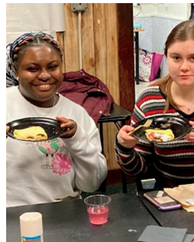
Clockwise from top left: Students guided by faculty make Salvadoran pupusas, aguas frescas, French crêpes for La Chandeleur.