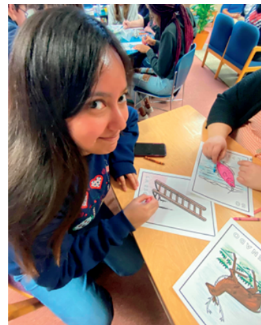
Clockwise from top left: Students enjoy making German Schnitzel, Rotkraut and Knödel...Or just a Bratwurst from Aldi... and other crafts in the Rincón Latino.