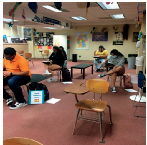
Then it became a COVID-era classroom.