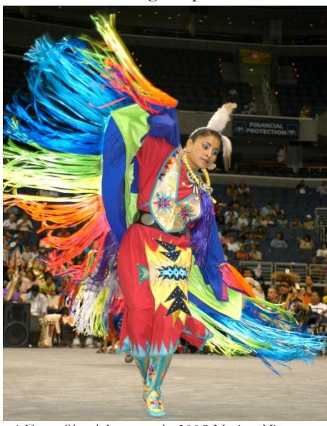
A Fancy Shawl dancer at the 2005 National Powwow.

Collier made religious dancing legal again, and "encouraged the revival of ancient dances that had previously been frowned upon as heathenism." January 3rd, 1934, Collier issued Circular 2970, which called for "the fullest constitutional liberty" and "required the Indian Office to show an affirmative, appreciative attitude towards Indian cultural values," stating that "no interference with Indian religious life or ceremonial expression will hereafter be tolerated. The cultural identity of Indians is in all respects to be considered equal to that of any non-Indian group." The purpose of powwows shifted, then. "No longer a spectacle for white entertainment, after World War II intertribal powwows grew out of community-serving veterans' homecoming celebrations."