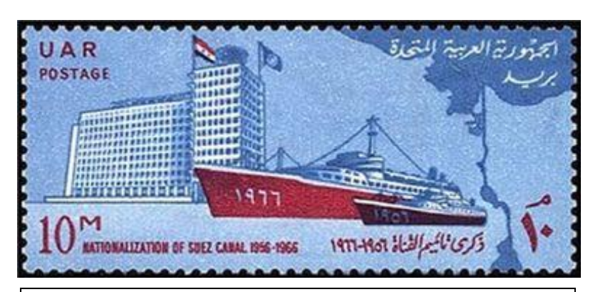
An Egyptian stamp celebrating the period during which the Suez Canal was the national possession of the UAR.

The events mentioned above can all be considered underlying factors creating a bed of tension between Israel and the rest of the Middle East, but there were also several more obvious factors at play. The Six Day War is also called the Third Arab-Israeli War, and one of the main causes for the third war would be the Second Arab-Israeli War. In the 1950s, the United Arab