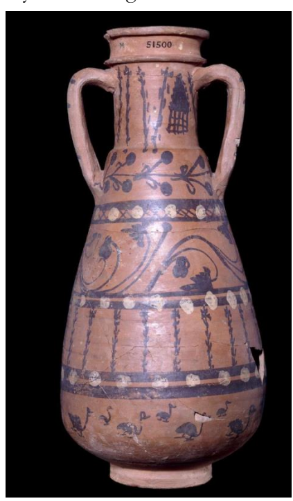
Figure 2: Nubian amphora found at Faras, 1st century BCE or CE, British Museum.

However, the question is: creolization for whom? Every piece of evidence presented here existed in a thoroughly elite context, with little evidence of creole penetration into the lower levels of Nubian society. In fact, there is strong evidence to the contrary. Greek culture was clearly the domain of the elite and highly exclusionary; as much is clear from Paccius Maximus' denigration of his own native ways, saying that Mandulis "charmed away the barbaric speech of the Aithiopians." While