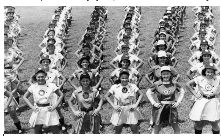
Spring Training, 1948 for the AAGBPL.

As the league fizzled out, so did memories of the league's stars. Though there were some excellent athletes, the league only kept tabs on those who played ten games in a season, but even then, they did not keep quality track of the records.<sup>77</sup> A plethora of people were impressed with the