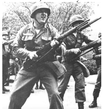
Figure 3: Menacing guardsmen at Kent State, Ohio State Lantern , May 5, 1970, photo by Ernst Wehausen.

Unlike previous newspapers, all reports involving Kent State were condensed onto the front page and not scattered throughout. The Ohio State Lantern clearly prioritized the shooting as its most important story. The very top of the front-page reads "Midwest Students React to Kent State." In this section, The Lantern reports on other the reactions of other Midwestern colleges. From student rallies, boycotts, marches, and class cancellations, a number of universities across the Midwest engaged in protest against the Kent State shootings. Some of the schools include the University of Wisconsin, University of Iowa, Michigan State, and Purdue.