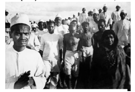
Gandhi on a march, 1930.

The Amritsar Massacre is one of the most well-known and bloodiest episodes in history. It demonstrated how the subjects of India felt about the Rowlatt Acts. The protest, organized by Mahatma Gandhi for the Indian people, was designed to start and end peacefully. Yet, it turned brutally violent when British troops arrived on the scene and fired upon the crowd. The East India Company's record of the Punjab district stated that the people in Amritsar gathered peacefully and