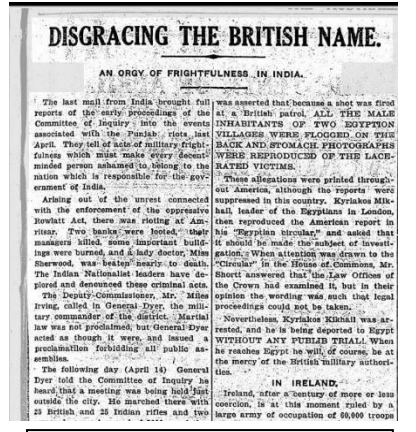
The Australian Worker's coverage of the Amritsar Massacre, March 25, 1920

Given their desperation, many Indians abandon the idea of peaceful satyagraha and moved on to a non-cooperation plan since they felt that peaceful protest was not making a difference in the attempt to free themselves from the Rowlatt Acts and British imperialism. To move away from a satyagraha required a grand change in mindset and demonstrates the level of frustration that is tied into the connection with the imperial rule in India. Since the Rowlatt Acts only acted in the best interest of the United Kingdom and not the people, conflict was inevitable. If leaders from the United Kingdom had treated their subjects with more respect, then there would have been less death and fighting for the same result.