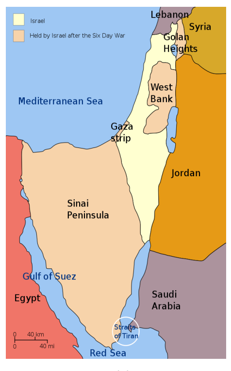
Map of the region

Israel overtook eastern Jerusalem, Sinai Peninsula, Gaza Strip and the West Bank (see map below). Eventually Israel would relinquish control of some of these territories back to their original owners, but even after that, Israel's new borders were highly contested. To this day, most countries do not recognize the new Israeli boundaries. Despite this, Israel continues to play a major role in the affairs of the Middle East and surprisingly has managed to form new treaties with its surrounding neighbors. But despite Israel's impressive victory, every war has its price. After the fighting, hundreds of thousands of people were displaced from their homes and forced to flee. Reports vary, but estimates have up to five hundred thousand Palestinian refugees evacuating the areas that Israel