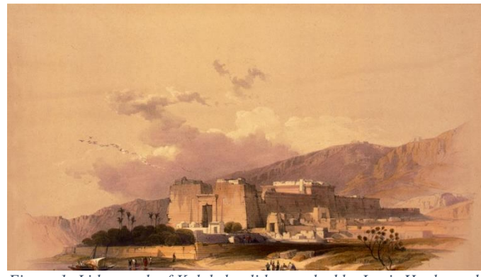
Figure 1: Lithograph of Kalabsha, lithographed by Louis Haghe and illustrated by David Roberts, published 1846-49.

In order to understand the imperial motivation in building and expanding Kalabsha, one must understand Roman Nubia's equally unique status within the Romans' perceptions of their empire. While we cannot fully say how the Romans conceived of their empire's limits, it seems that they had some conception that Nubia, who they called Aethiopia, lay at the very edge of the world itself. Indeed, if there is one theme that most emerges from Greek and Roman sources' treatment of Aethiopia, it is the extreme distance from the