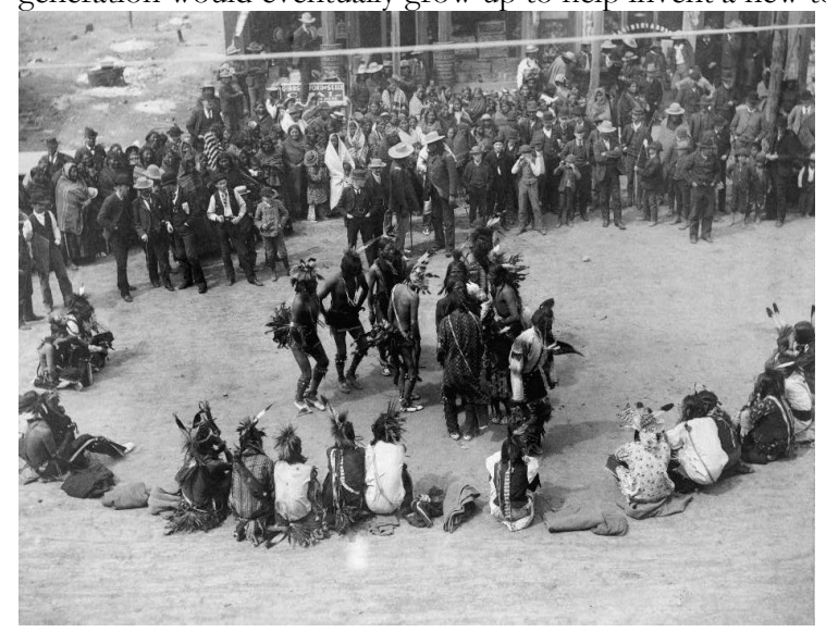
Cheyenne dancers performing the Omaha dance at a Montana powwow in 1891.

subjected to them.<sup>3</sup> Children who survived these residential schools and other members of their generation would eventually grow up to help invent a new tool of resistance— the powwow.