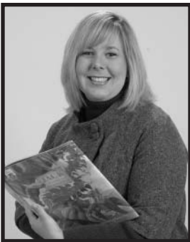
Kelly Shore Elementary Education- Teacher Certification