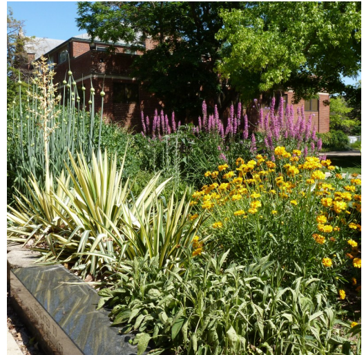
Garden West of Student Services

The next time you see one of our Grounds Crew, smile, wave and thank them for doing a great job of Holding our Ground.