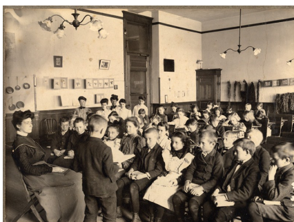
Training School Old Main

Questions for April/May quiz are listed above. Remember, there are many sources where Eastern information can be found. Don't give up, when you look in only one or two - there's bound to be another book that has just the right answers. Good luck!