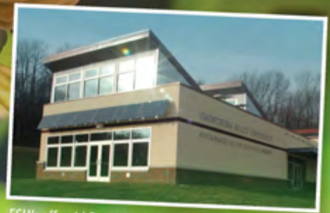
FSU's off-grid Sustainable Energy Research Facility