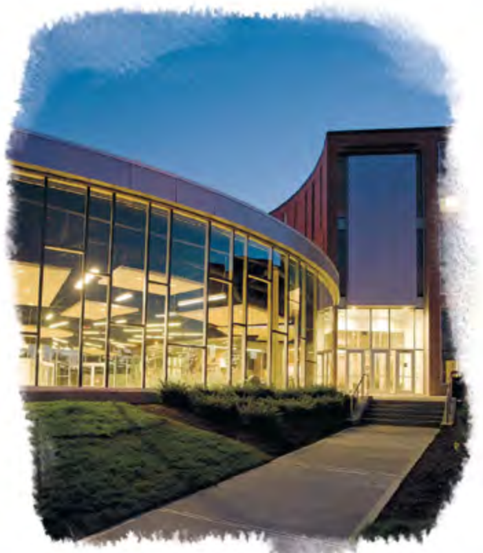
LEED Platinum Certified Student Innovation Center