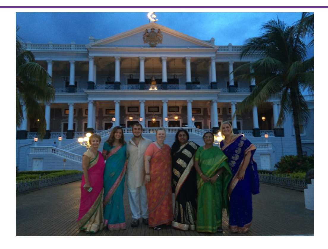
The group outside the Falaknuma Palace , all dressed up for a Palace dinner.