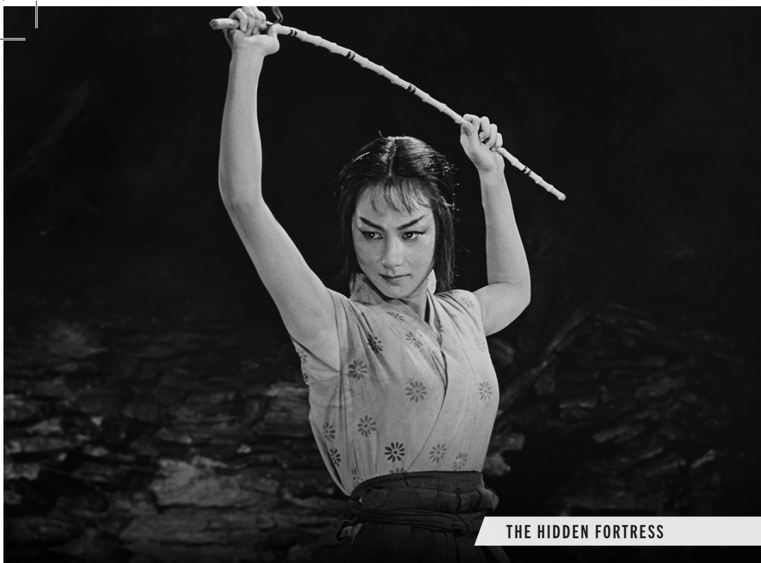
THE HIDDEN FORTRESS