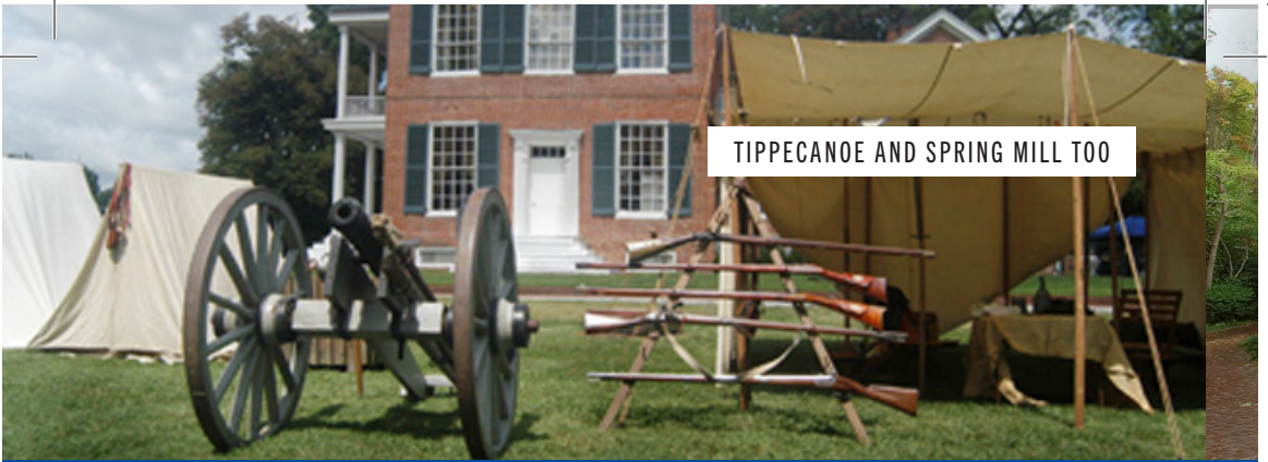
TIPPECANOE AND SPRING MILL TOO