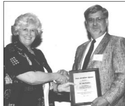
Interim Provost and VPAA at the annual Adult and Continuing Education Awards Banquet held on May 7, 2001. The Paul Overton Award is given to faculty that have devoted numerous hours to delivering off campus instruction to numerous sites throughout Illinois.