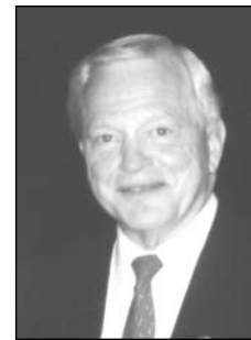
Knollenberg Distinguished Alumnus Award

Manufacturers and the National Federation of Independent Businesses.