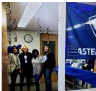
EIU Dept. Human Services & Community Leadership