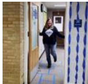
EIU Office of Nutrition & Dietetics