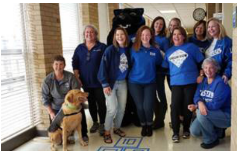
EIU Health Promotion