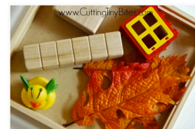
SOUND EFFECTS BOX