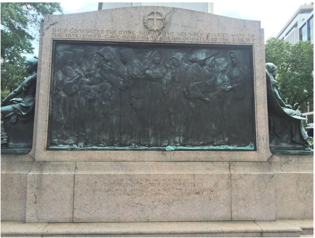
Nuns of the Battlefield Monument, Washington D.C. Personal photographs by author. 1 August 2016.