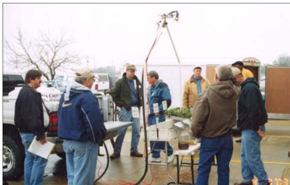
Participants inspected the rainfall simulator and trailer and offered suggestions for improvements.

A vital component of the Embarras River Management Association's (ERMA) plan of work is an aggressive conservation education outreach program. ERMA was recently notified that its project titled, "Rainfall Simulator/Crop Residue Demonstration Unit", was selected for funding under the EPA Section 319 Nonpoint Source Pollution Control Project. The rainfall simulator unit provides a very effective visual demonstration of the power of a raindrop on the soil surface, and the value of vegetation or crop residue in reducing soil erosion and nutrient leaching, while improving soil moisture retention. These units will be an effective conservation education tool to be utilized at conservation field days, tours, schools, and other events.