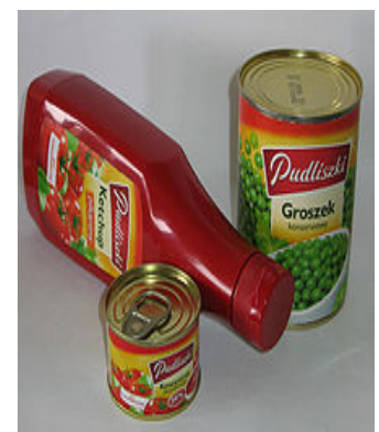
Food Drive at FPM