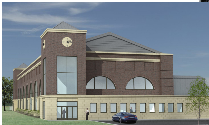
© 2009 international architects ateller eastern illinois university - renewable energy center north view