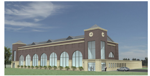
EIU Renewable Energy Center