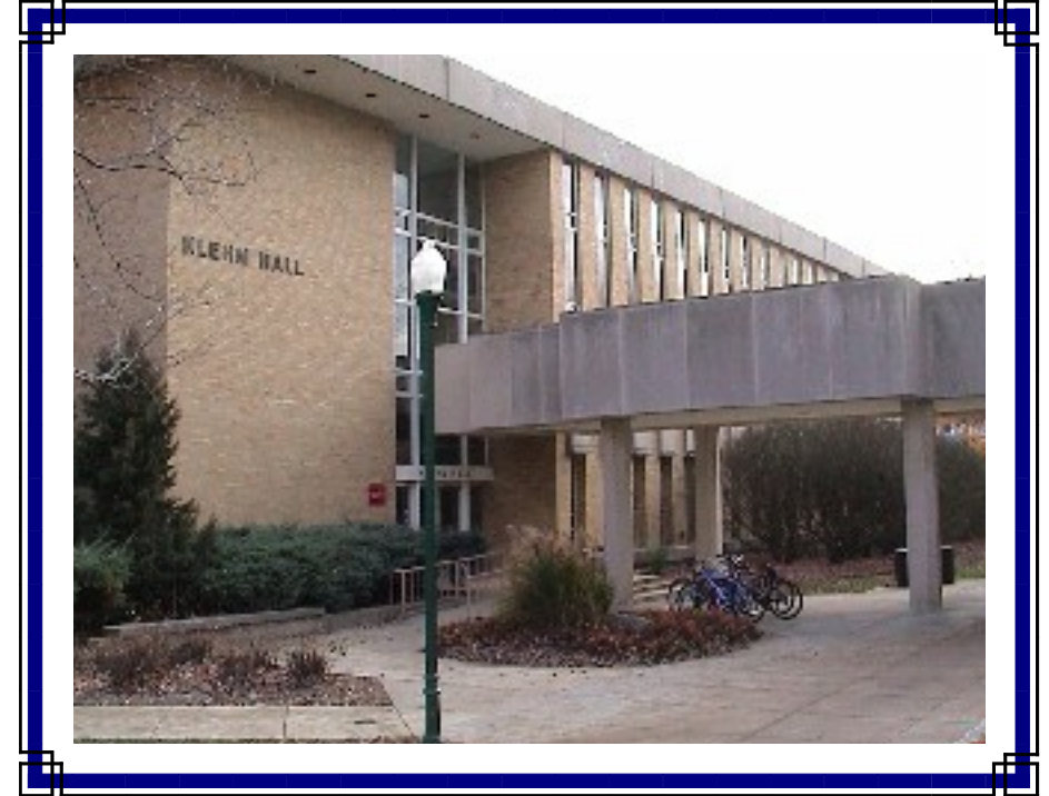
Klehm Hall — Home of the School of Family and Consumer Sciences