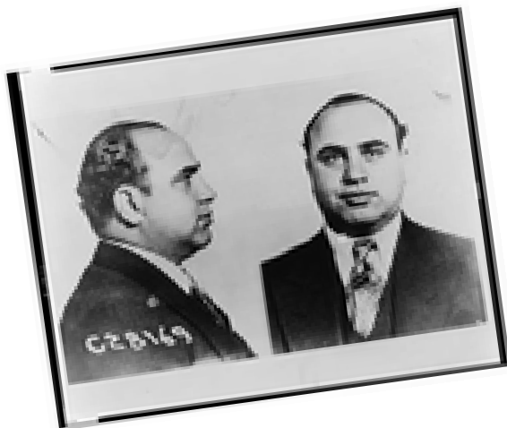
Two "mug shots" of Al Capone, half-length portraits, one facing front, the other facing right.