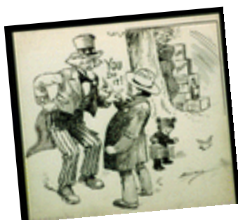
You do it! / Berryman

The Dry Years http://www.loc.gov/rr/print/list/073_dry.html