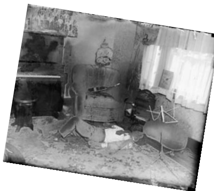
A Murdered Joseph "Little Joe" Roma

Music for the Nation: American Sheet Music, ca. 1820-1860—The Temperance Movement http://www.loc.gov/teachers/classroommaterials/connections/sheet-music-1820/history5.html