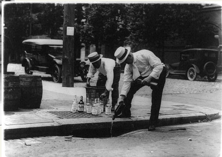
Pouring whiskey into a sewer.