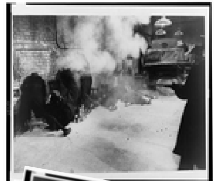
Bodies of gangsters lying on a Chicago garage floor following the St. Valentine's Day massacre