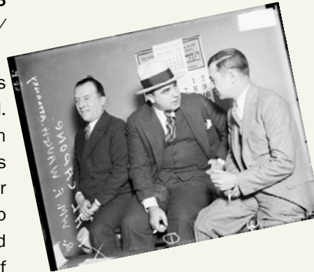
William F. Vaughn facing Al Capone Library of Congress American Memory

Library of Congress, American Memory Accessed 11.09.09