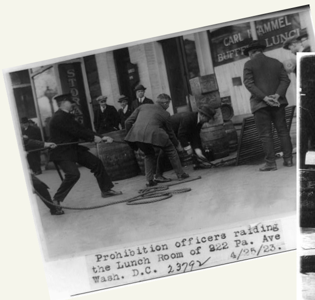
Prohibition officers raiding the lunch room of 922 Pa. Ave., Wash. D.C.