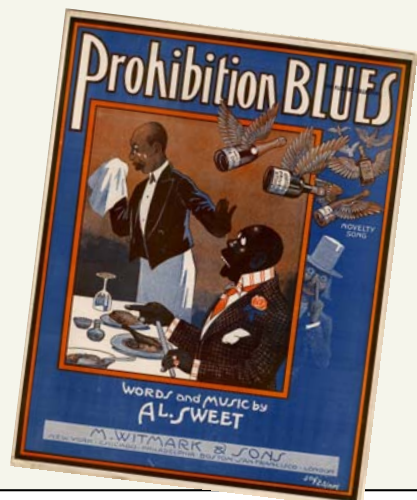
Prohibition blues, 1917