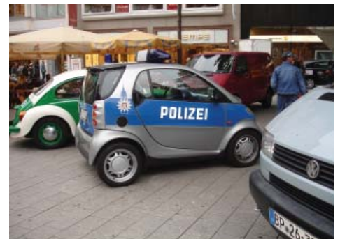
Smart Police Car in Hamburg, Germany

"The traveler sees what he sees. The tourist sees what he has come to see." ~G.K. Chesterton