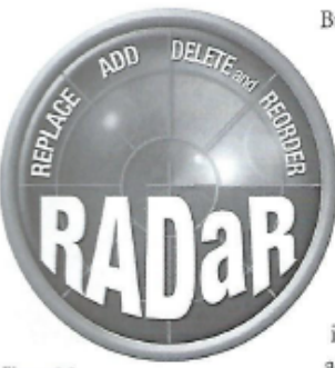
Figure 8.3 RADaR: The Four Steps of Revision

But it could be a lot better." The good news, I tell them, is that unlike the remodeling of a house, the remodeling of an essay does not require nineteen steps (or lots of money). In contrast, remodeling an essay only requires four steps. To teach my young writers how to take lousy essays and make them better, I show them the four steps of revision that writers do when they run their papers under the "RADaR" (see Figure 8.3).