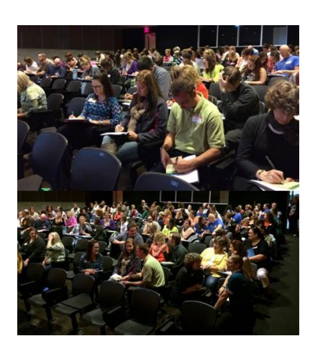
Institute Day 2014 Keynote Audience