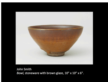
Sample image, 3d