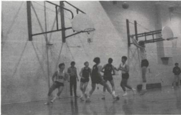
Ninth Grade Basketball