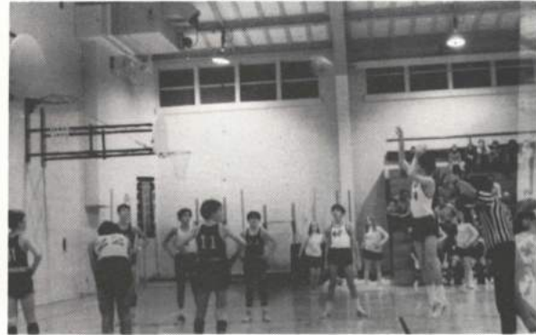
Eighth Grade Basketball