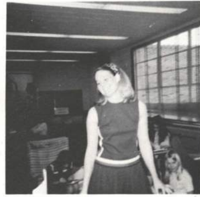
Smile! You're on candid camera.