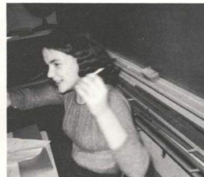
Exit, stage left.