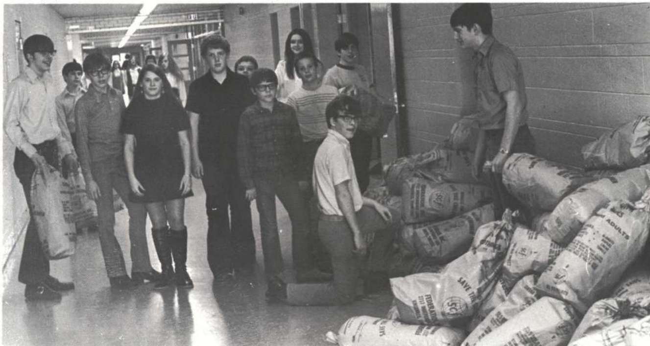
STUDENT COUNCIL PROJECT - Bundle Day Drive