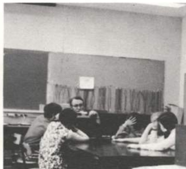
Are you sure you understand?