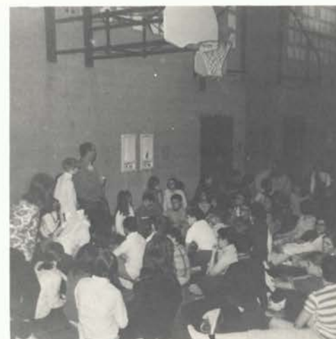
the co-rec crowd