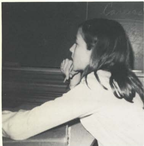
"It isn't that way at all."