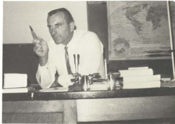
"and when I was a flier in the Civil War"