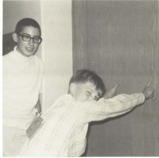
Say the alphabet backwards