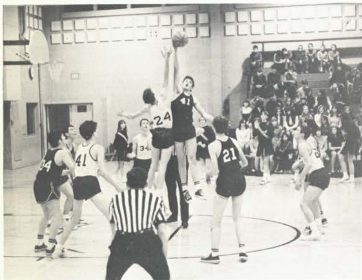
Who are those good looking players in the top bleacher?