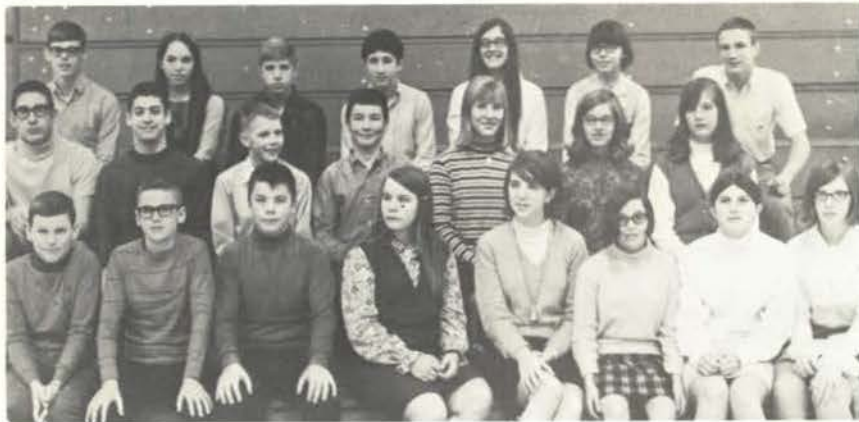
Our Student Council