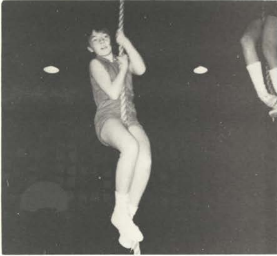
Hang 'em high!