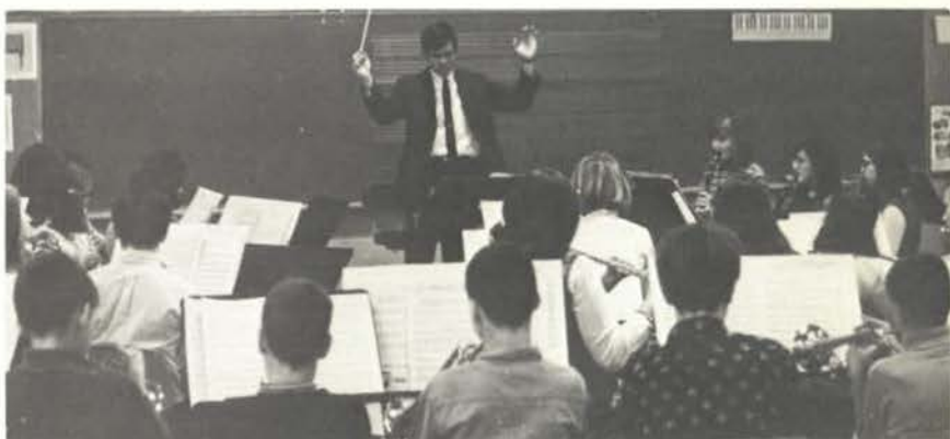
All together now