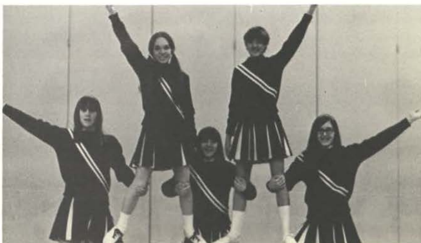
We also lead cheers--