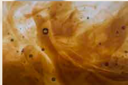
Ben Weiner C6H12O6 , 2009, oil on linen, 28 x 42 inches.

www.bcontemporary.com www.markmooregallery.com