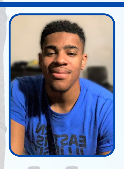
**EIU is a place where anyone can flourish. **

Everything is opened up and everyone is so friendly, so it seems more like a college environment. The overall atmosphere is a lot lighter.