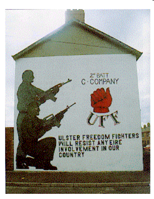
Figure 7: Military. Snugville Street, Belfast, 1984.

The more violent murals, that started to appear in the 1970's, portrayed armed men that were either firing their weapon or standing by in a permanently watchful pose (see figure 7). There was a constant threat of violence from Republican organizations.