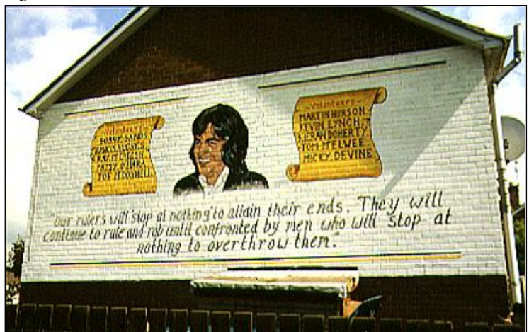
Figure 1: Hunger Strike Mural, Lenadoon Avenue, Belfast, 1998.

used these large, and seemingly inescapable, murals all over the walls to not only take a stance on the situation at hand, but also to encourage the neutral parties and communities to align with their organization.