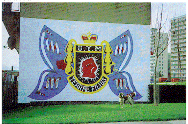
Figure 9: Red Hand of Ulster. East Way, Rathcoole, Newtownabbey, near Belfast, 1993.

The last Loyalist theme that came to appear in murals of the 1990's was the use of flags, coats of arms, or slogans, anything that displayed a symbolic portrayal of the Loyalist ideology (see figure 9). The display of these symbols was especially powerful at this time due to the passing of the Flags and Emblems (Display) Act. <sup>16</sup> Prominent images that were displayed by Loyalists were the Union Flag, the Red Hand of Ulster (see figure 9), and portrayals of the British crown. <sup>17</sup> The Loyalists felt the passing of the Flags and Emblems (Display) Act was a means of oppressing their culture. The Unionist murals using such symbols sought to strengthen Loyalist and Unionist organizations. The use of these symbols, despite laws against it, is another form of Loyalist's representation of dominance in culture and their desire to maintain loyalty to Great Britain.