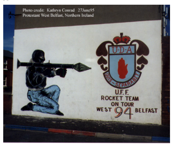
Figure 8: Parlimentary Mural. Shankill Road, Protestant West Belfast, 1995.

The murals emanated the powerful message that their soldiers were willing and ready to protect Unionists from any harm. The images of the soldiers protecting Unionist territories connected both Loyalist organizations and Unionist communities. These murals portrayed a sense of protection, but also reminded the community members to remain strong and loyal in times of distress as well as advertising for military and organizational support. These murals were also meant to serve the purpose of sending a warning to Republican organizations, which is why they were specifically designed to be threatening and violent in nature (see figure 8). The images were portrayals of Loyalists who were going to fight until the battle for their cause was won. These soldiers were also painted in place on the walls as a means of marking territory in an extremely threatening manner. The explicit message was that anyone who crossed the boundary would face radical punishment from the Loyalist military. By placing their soldiers in communities, Loyalist organizations could claim to represent that cultural group and give the community protection in exchange for the community's support.