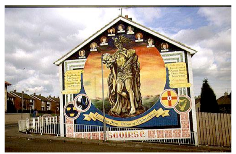
Figure 13: Cú Chulainn. Lenadoon Avenue, Belfast, 1996.

detained during the hunger strike. This is a symbol of the Republicans' enduring strength despite the repression of Loyalists and the British (see figure 12).