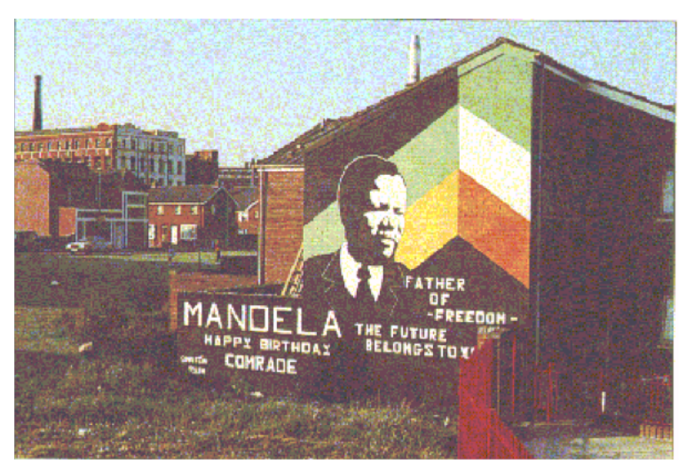
Figure 18: South African Solidarity. Falls Road, Belfast, 1988.

strong connection to the releasing of prisoners in South Africa and their pursuit of reconciliation in the country. The Republicans were facing nearly the same situation. The first South African mural appeared in 1986 (see figure 18).