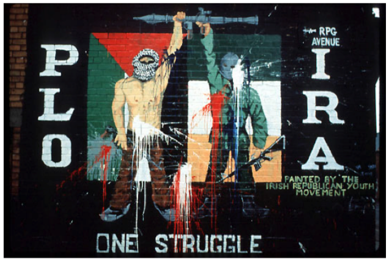
Figure 17: PLO & PIRA. Beechmount Avenue, Belfast, 1982.

examining the Republican murals and their references to international themes. Rolston has noted three major international conflicts that the Northern Irish Republicans strongly connect to and portray often in their murals. Many of these include various Palestinian, South African, and African American heroes.