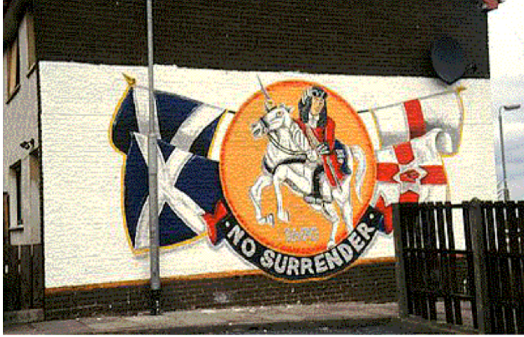
Figure 6: King Billy. Kilcooley, Bangor, County Down, 1997.

The more violent murals, that started to appear in the 1970's, portrayed armed men that were either firing their weapon or standing by in a permanently watchful pose (see figure 7). There was a constant threat of violence from Republican organizations.