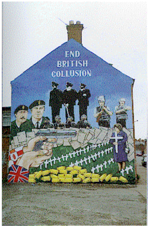
Figure 16: Plastic Bullets. Oakman Street, Belfast, 1994.

Republican mural traditions took another, more international plea for support. Murals of Republican international solidarity were used to connect to and draw the support of other