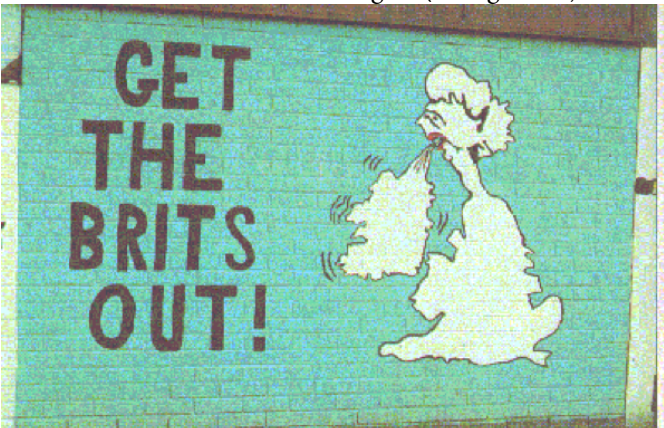
Figure 10: Britain oppressing Ireland. Rossville Street, Derry, 1981.

Much like the Loyalist murals, Republican muralists also drew upon themes and powerful images to create a Republican identity. Republican Murals were located mostly in the Catholic Falls Road, Ardoyne, and Upper Springfield areas of Belfast, and the Bogside, Foyle Road, and Creggan Areas of Londonderry. 18 Loyalist mural tradition had been established as a way in which to conserve the existing state of affairs, while Republican murals expressed revolutionary images in support of the Unionist movement to take control of the government and create social change. The challenge, however, Republicans faced was that their organizations were illegal and could not be accepted or recognized openly by any police or government force such as the British military. The Loyalists were able to enjoy that acceptance and recognition, the Republicans had to fight to legitimize their cause. Republican muralists wanted to underline the mistreatment Northern Irish people faced at the hands of British authorities and Loyalist groups. This gave the Republicans the social justification they needed; the Republican organizations were claiming to be protecting the people of Northern Ireland and their civil rights (see figure 10).