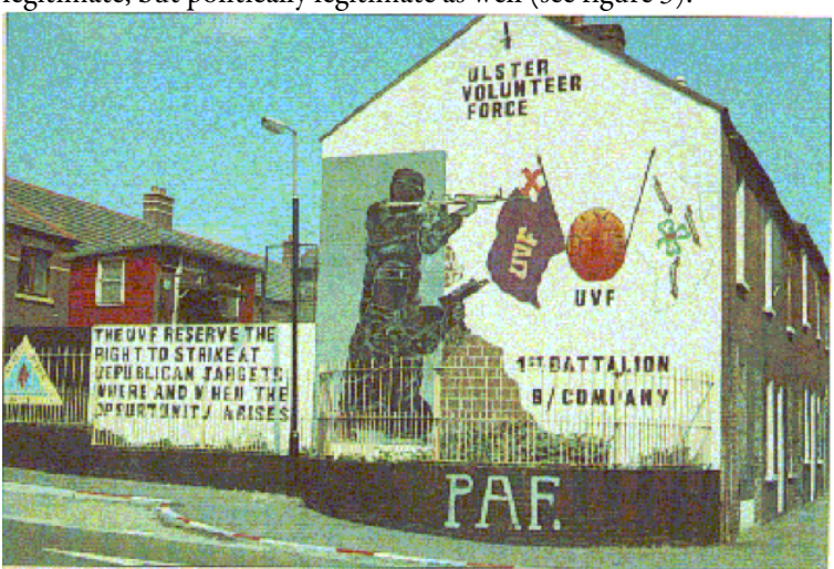
Figure 3: UVF volunteers in action with automatic weapons. Ohio Street, Belfast, 1985.

Nationalist (Republican) murals developed into propaganda tools as a way of countering the influence of Loyalist, or Unionist, political dominance.<sup>8</sup> The Loyalist murals have recurring images that show masked men with guns as hero-like figures that are devoted to a just and right cause that is not only religiously legitimate, but politically legitimate as well (see figure 3).