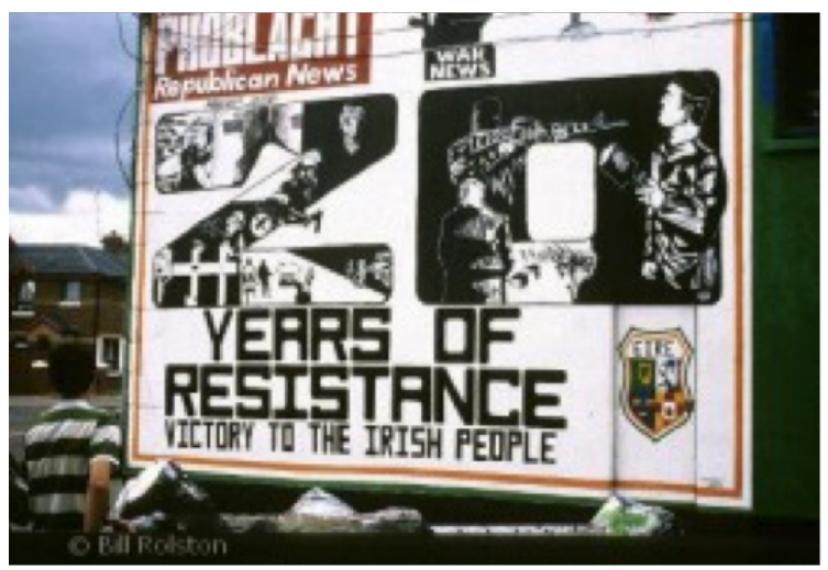
Figure 21: PIRA. Sevastopol Street, Belfast, 1989.