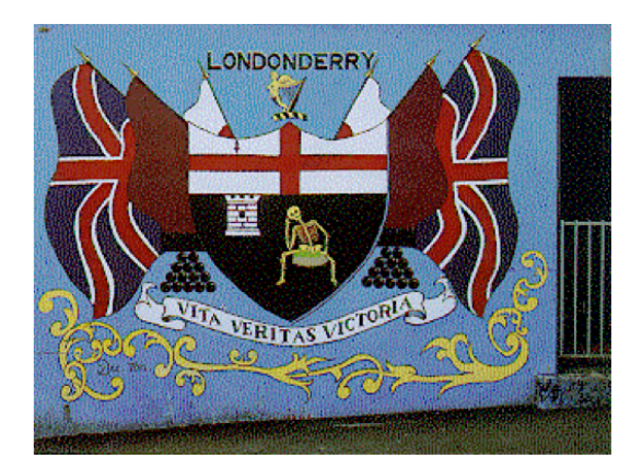
Figure 5: Flags. Bond's Street, Derry, 1981.

The early Loyalist images depicted in the murals sought to legitimize the British hegemony and political status. This was done through significant historical events that supported Protestant ascendancy. The most popular historical Loyalist image portrayed is of "King Billy." 14 King Billy's victory at the Battle of Boyne is considered the defining movement that legitimatizes Protestant ascendancy and cultural dominance. 15 King Billy's continuing appearance in the murals is reinforced by the muralist's paintings of the Twelfth of July celebrations. King Billy is almost always portrayed on a white horse, wearing a spotless uniform with a look of valor (see figure 6). King Billy was depicted as a Protestant hero who defeated Catholic forces and freed Londonderry from Catholic siege. King Billy's portraits and the entire Twelfth of July Celebration are symbols of Unionist victory and dominance. Loyalist's muralists used this message to remind Unionists of their dominant culture while portraying a constant reminder of Nationalist oppression.