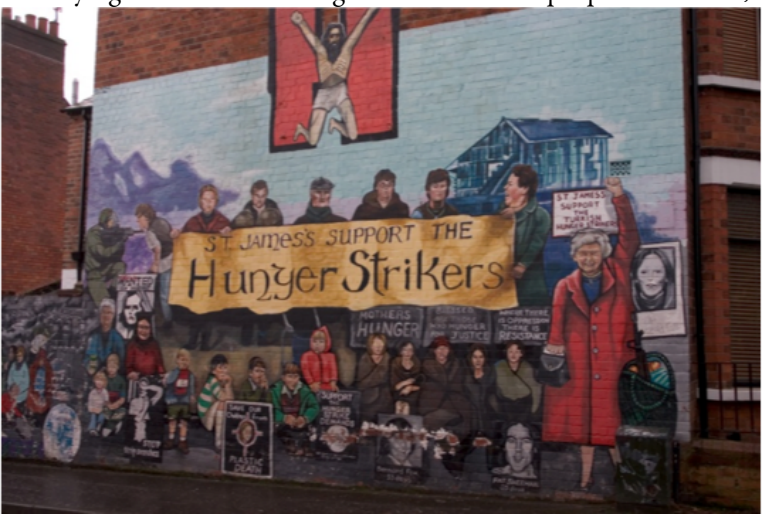
Figure 12: Hunger Strikers. Belfast, 1981.

Similar images of other hunger strike victims are portrayed in murals as well. The hunger strikers are often portrayed naked, emaciated, and bearded to give them a Christ-like appearance.<sup>20</sup> Both sides of the Troubles claim to represent two different religions and take claim of these religious identities as their culture and underlying differences among Northern Irish people. However,