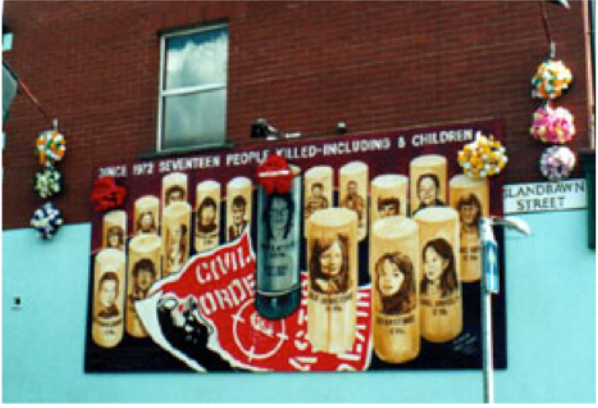
Figure 14: Memorial Mural. Catholic West Belfast, 2000.

narrative tradition that asserted their roots in Northern Irish history.