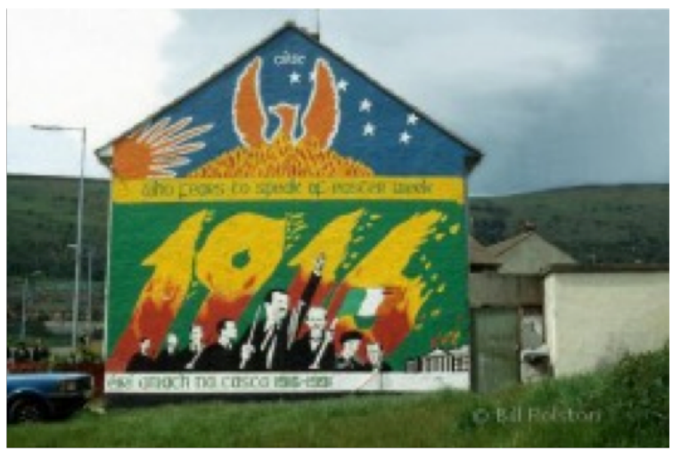
Figure 20: The Phoenix. Whiterock Road, Belfast, 1991.

markers and warnings, but also a reminder to support the movement and the PIRA (see figure 21).