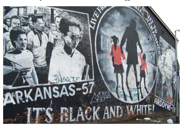
Figure 19: Civil Rights, Shankill, Belfast, 2008.

The representation of the armed struggle itself is the last