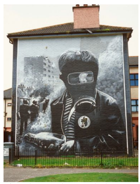
Figure 4: The Petrol Bomber-Bogside, Derry, 1994.

use of murals as propaganda took an emphasis on the hegemony Britain had over Northern Ireland. It was a further development of the political ideologies of the unionist movement. The Republican murals often expressed a cultural resistance within the idea of Irish Nationalism. Each singular movement wanted to portray their own one-sided version of Northern Ireland's history that would support their own political ideologies and goals. Both Republicans and