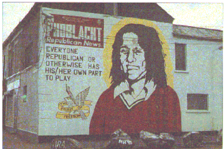
Figure 21: Bobby Sands. Sevastopol Street & Falls Road, Belfast, 1990.

their current struggle both locally and worldwide. Gregory Goalwin states that similarly to the Loyalists, Republicans draw upon five different themes in their murals: martyrs to the Republican cause (mainly the hunger strike), memorials of innocent victims, support of worldwide civil rights acts, symbolic expressions of identity, and representations of the armed struggle. Republican murals, unlike the Loyalist murals, did not develop in themes over time. All five themes have appeared from the beginning.