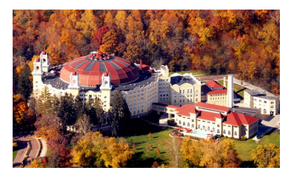
West Baden Springs Hotel, French Lick, IN

All this information boils down to a few simple things. The crimes committed by the outlaws and other river pirates impacted growing Illinois more than the court systems, and the national government as a whole, saw coming. The national government, even Thomas