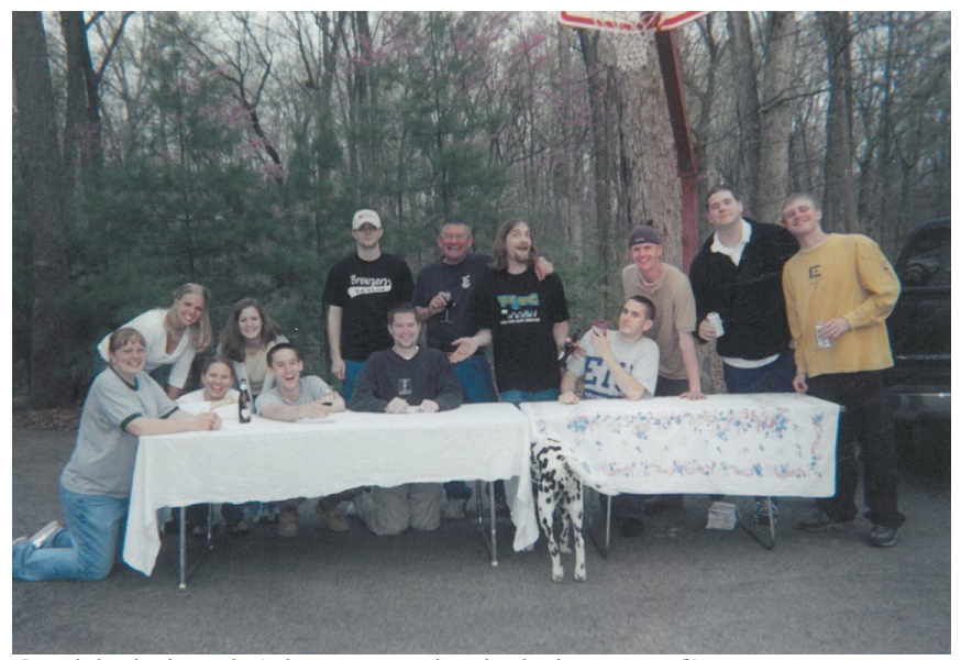
Geoclub picnic at Jim's house, sometime in the late 1990s (?).