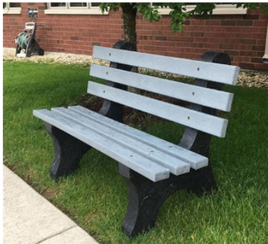
Partnering with the Life Academy in Mattoon, IL, Geoclub students collected plastic caps to divert them from landfills and having them fashioned into park benches.