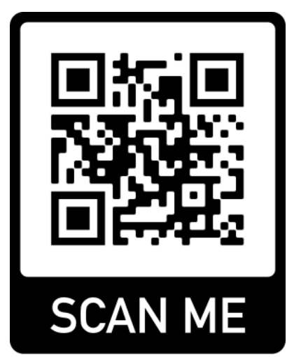
For more information on the PSM program, scan this.

We have instituted new classes (Lidar, Web Mapping, etc.) this year, shaken up the curriculum, and most importantly moved the degree fully online . We are looking to make the program as relevant as possible to working professionals. If you know someone looking to further their education in GIScience, and looking to study in a small, personalized environment, we'd love to hear from them.