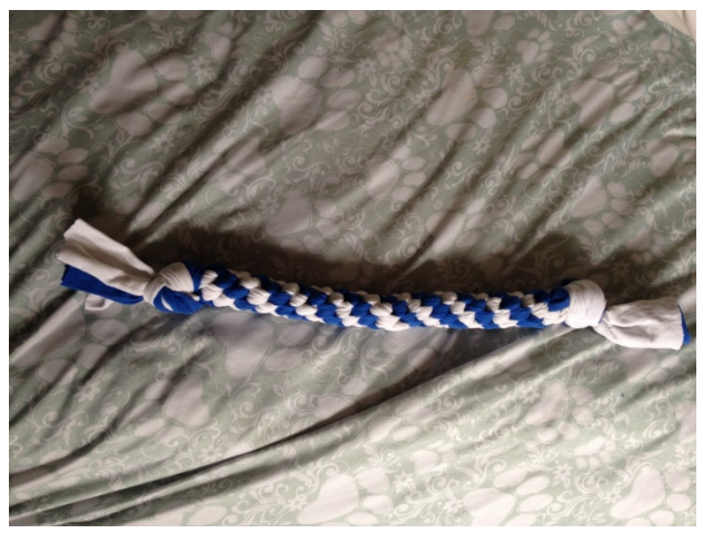
Dog rope toys were created from recycled t-shirts and donated to local animal shelters to give the dogs some joy.