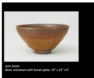
Sample image, 3d