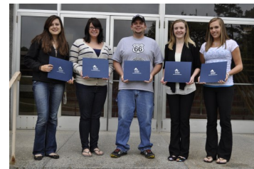
2012 Student Scholarship Recipients