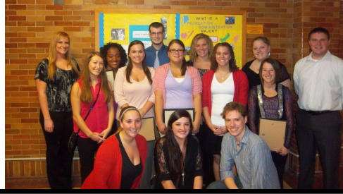
2012-13 Rho Phi Lambda Members

Students who have a major GPA above 3.20, completed at least 45 semester hours, and demonstrate a record of scholarship, leadership and service are invited to join this national honorary society for recreation, park and leisure services students. As of the Fall